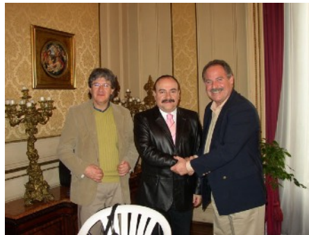
FEDES directors with the President of the Chamber of Deputies of the Republic of Chile, Mr. Antonio Leal