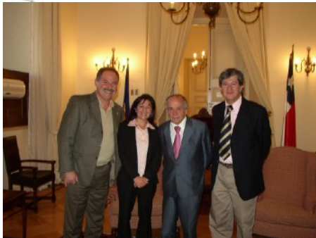
FEDES directors with the Minister of the Interior, Mr. Andrés Saldivar.

During the month of April, directors of the FEDES Foundation met with the Minister of the Interior, the Director of Socio-Cultural Affairs for the Presidency, and with the President of the Chamber of Deputies. During the meetings, the participants discussed the possibilities for cooperation between the Foundation and government agencies. At the same time, important visits were received at the Foundation's facilities.