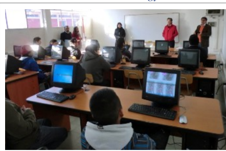
2 courses in Warehouse Administration and Stock Management