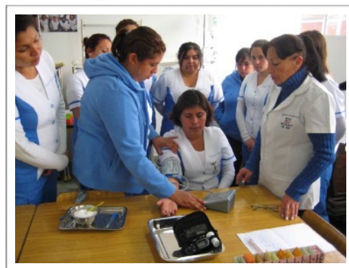
2 courses in Care for the Ill and Elderly

Due to the difficult circumstances that many of the students live in, helping them become truly prepared for the workplace often reaches beyond merely passing on vocational skills. Many of them are single mothers, live in extreme poverty, or are in other ways fighting adverse odds to come back to school and take steps towards long term progress. FEDES’ student support team supports them with counseling, makes home visits, follows up on them throughout the internship phase, serves as an intermediary between them and hiring companies, and works tirelessly to give them the best shot possible at their new livelihoods.