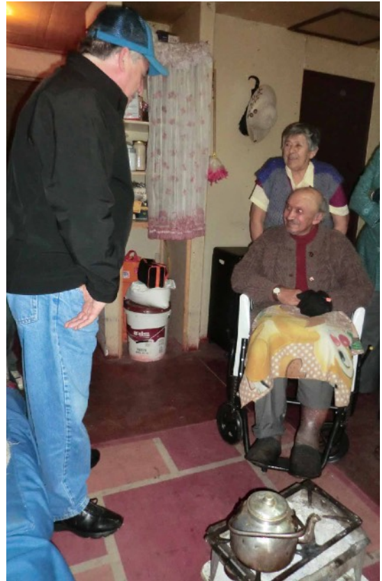
Photo 3: Retirement home "San Camilo" which is run by nuns from the order of San Camilo. This home was completely destroyed by the earthquake of February 27th, 2010, and they lost everything. One area was recently rebuilt and they hope to rebuild the other side as soon, as there are so many elderly homeless. They were very thankful for the wheelchairs they received.