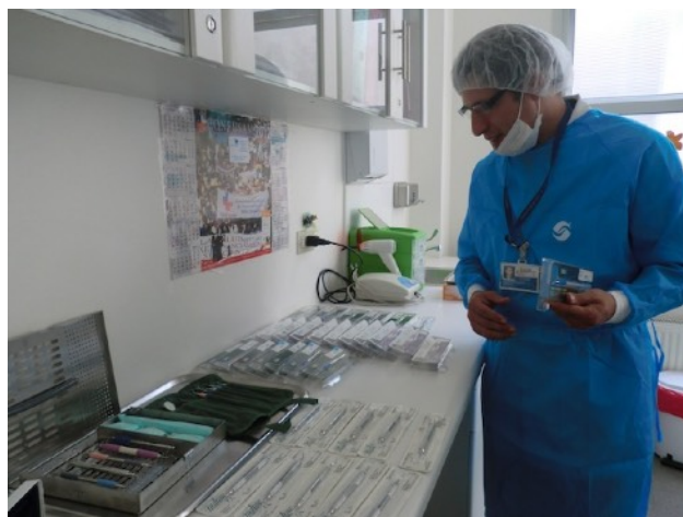
(Above) Dentist in a public clinic with a gown, hair cover, mask, and sets of dental instruments donated by Direct Relief.