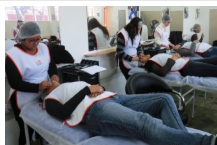
1 course in Cosmetology

Sewing: After the two first months of instruction, many of the young women taking the sewing course were already producing and selling the clothes they learned to make. In the morning they come to class to learn new skills, and in the afternoon they make clothing for sale and are beginning to earn an income. This way FEDES essentially helps “walk them through” the entrepreneurship process and making the transition to running their micro-business on their own much easier.