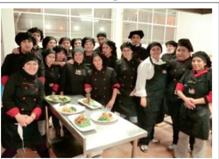
4 courses in International Cuisine w/baking.