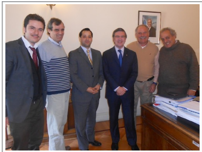
Meeting with the then Minister of Social Development