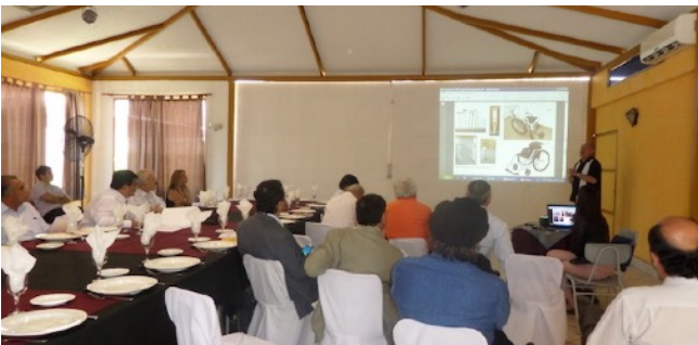
Meeting of the Association of Mayors of the Cordillera V in San Felipe.