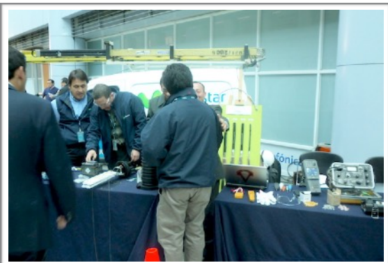
Moment where the participants received their work kits to begin their internships

Telefonica organized an activity for the scholars in the Training Program for Work, taught by Sence through Fedes and the Romans XII Foundation. In which all the students that had done the course of "Technical Assistant in Telecommunications" participated.