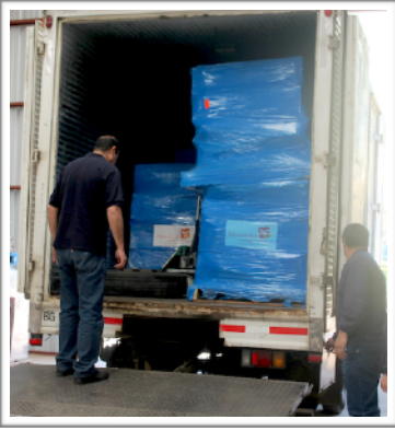
Unloading the container into warehouses, for things to be classified for the distribution of the donation.