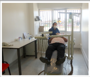
(Just inaugurated) Secondary care room for dental hygiene in Bernardita Benveniste clinic.

In 2013 we distributed three containers full of medical supplies and equipment for clinics, hospitals and individuals that were in the bed ridden program. It contained clinics electrical beds, hydraulic manual beds and orthopedic equipment, dental instruments as well as surgical, miscellaneous supplies, and diapers.