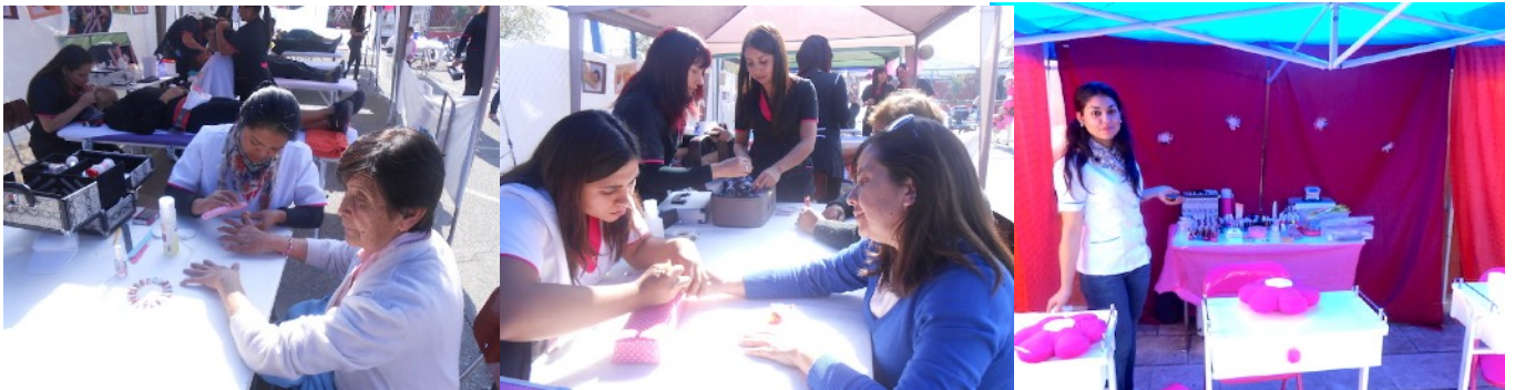
Sequence of photos taken of the day of the fair.

It is a space in which the theoretical and institutional activities converge, represented by students and their experience as entrepreneurs compared to the expectations and those of the community in order to acquire skills in the pursuit of business opportunities and to make their business ventures.