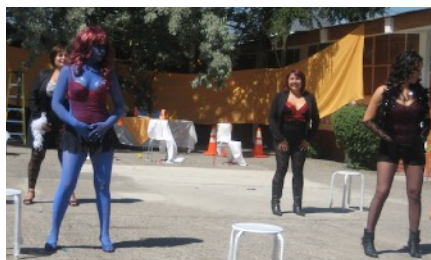
Photo 1: Here the saying: "A picture is worth a thousand words ..." no doubt enjoyed the activity.

The winning group was the GREEN Alliance, who knew how to compete with great enthusiasm, demonstrating its speed, joy, and originality, but especially for bringing the TV networks to the school and thus give more publicity and professionalism to the Christmas activity.