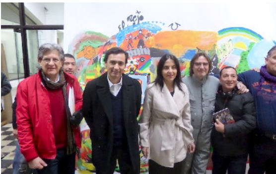
The Minister of Justice Patricia Perez appears in this picture with Mauro Rivas of Telefonica, Hugo Avila and some of the participants of the course

A few days before the end of the course, the group was invited by the Minister of Justice, to paint a mural, a collective creation done on one of the walls of the Ministry Building.