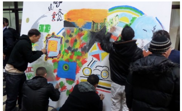
Picture of the group painting the mural.