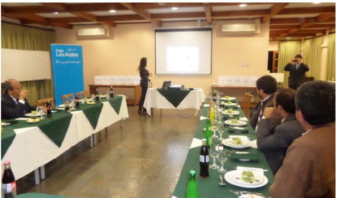
Dinner sponsored by Caja Los Andes La Serena, with Mayors and Councilors IVRegion , Business Associations CORMINCO and ASOINCO.