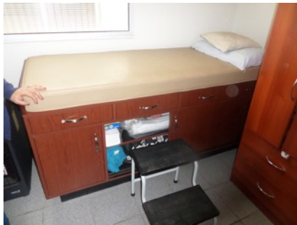
Examination tables with drawers to store necessary equipment and supplies.