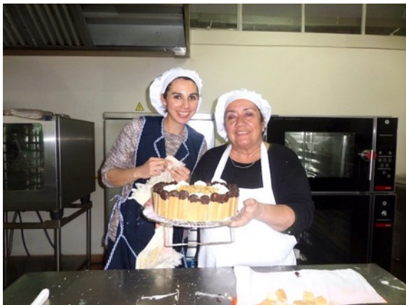
Culinary Art students

A large part of our courses are focused on employability and job insertion, and as such we have established new agreements with different companies to include our students in their intern programs as well as their working force. We maintain, as always, courses with freelance options that allow women in particular (single mothers for the great part) to provide for their families as well as maintaining their household.