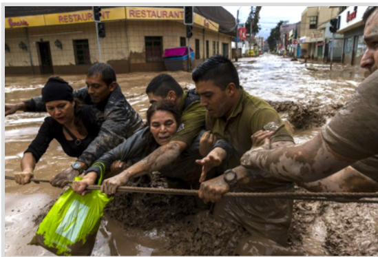
Captions of the flooding in the city of Copiapó. (Photos by soychile.cl).

"According to the official report provided by the Ministry of Interior and the Onemi (National Office of Emergency): The intense precipitations have destroyed dozens of houses, there are 6,000 people initially affected and 539 people who have been placed in provisional shelters in the affected areas. The total balance from the catastrophe in the north of the country is 24 deceased and 69 missing... The authorities later corrected their initial estimations to more than 29,661 affected and more than 2,071 destroyed houses with a further 6,254 households with major damage.... Source: emol.com