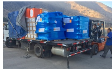
Loading of one of the trucks headed to Copiapó.