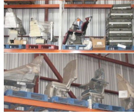
Dental Chairs donated by USAID and Free Wheel Chair Mission